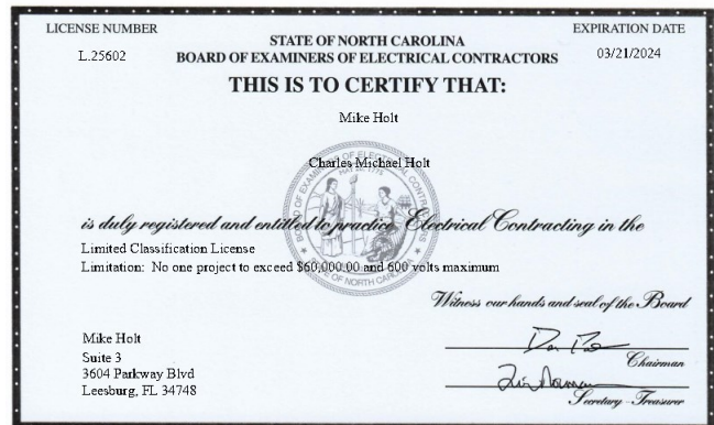
North Carolina L.25602 Exp: 03/21/2024